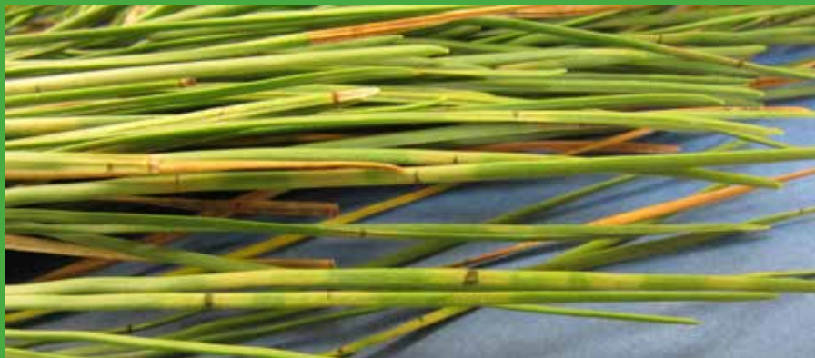
Red needle cast: Distinctive lesions and bands are pointers to red needle cast infections. In severe cases, the needles turn red, then brown, before being shed

“We didn’t know how far it would spread or how it would behave in following years. We immediately made it a priority for research.