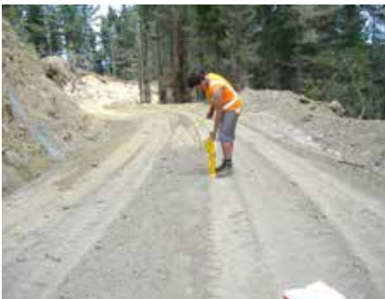
As part of his forest engineering studies a University of Canterbury student tests a forest road for strength/stiffness using a Clegg hammer