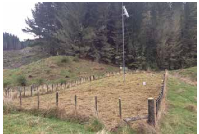
Fitzroy's eyes and ears This one is monitoring conditions in Ruapehu