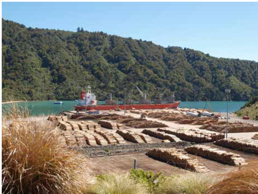
Marlborough's Shakespeare Bay is currently a log fumigation site By 2020 the industry plans to have tools that will eliminate the need to release MB gas to the atmosphere after fumigation

FINDINGS FROM A MAJOR RESEARCH PROGRAMME WILL HELP LOG, TIMBER AND HORTICULTURAL PRODUCT EXPORTERS TO IDENTIFY NEW WAYS TO COMPLY WITH PROPOSED RESTRICTIONS ON THE RELEASE OF METHYL BROMIDE.