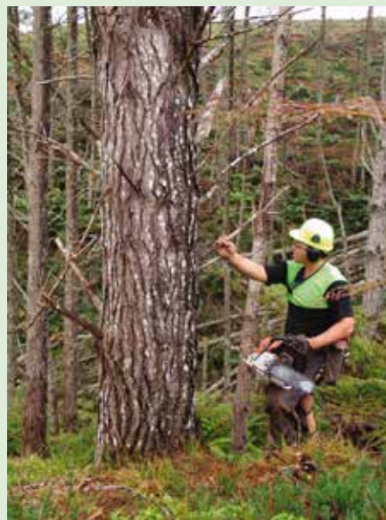
A great outdoor job But the working environment needs to be much safer

As the panel points out, many of these changes will be driven by a need to comply with the new Health & Safety Reform Bill. The Bill imposes health and safety obligations on all people conducting a business, throughout the supply chain.