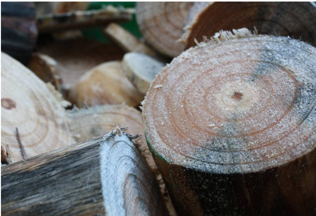
Figure 1. Pinus radiata log section with blue sapstain visible on both the cut faces, and under the bark (Photo: James McCarthy).

Severe wind and snow storm events in July and August of 2008 caused significant damage to several production forest estates near Nelson (South Island). These storms raised questions about the time available for the salvage harvest of damaged trees before extensive damage by insects, sapstain (Figure 1), and decay fungi reduce the value of affected timber. Radiata pine ( Pinus radiata ), the predominant species of New Zealand's plantation forests, is highly susceptible to attack from sapstain and decay fungi which damage the wood both structurally and cosmetically (Childs, 1966). The development of sapstain in windthrown timber reduces the window of opportunity for salvage harvesting before its merchantability is affected, or eliminated entirely (Childs, 1966). In the 1990s, the effects of sapstain caused an estimated revenue loss of NZ$100 million per year in New Zealand (Wakeling, 1997), a significant loss of revenue for the forestry sector.