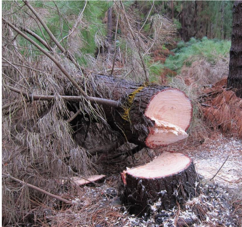
Figure 2. One tree severed at the base, felled for the winter windthrow simulation in Christchurch.

To determine if a relationship exists between bark beetles and associated sapstain fungi, several approaches are being used. Mesh has been applied to fresh pine logs to exclude insects to assess whether this will reduce sapstain compared with control logs (without mesh) where bark beetles have unrestricted access and can potentially transmit fungal spores. Bark beetles caught emerging from logs are being used to inoculate agar plates to isolate fungal species transported by the beetles. Whole beetles and different parts of beetles such as the elytra - where fungal spores are thought to be harboured in pits (Francke-Grosmann, 1967; Beaver, 1989; Haberkern et al. , 2002) - are being compared. A combination of morphological and molecular techniques is being used to identify fungal species for all components of this project.