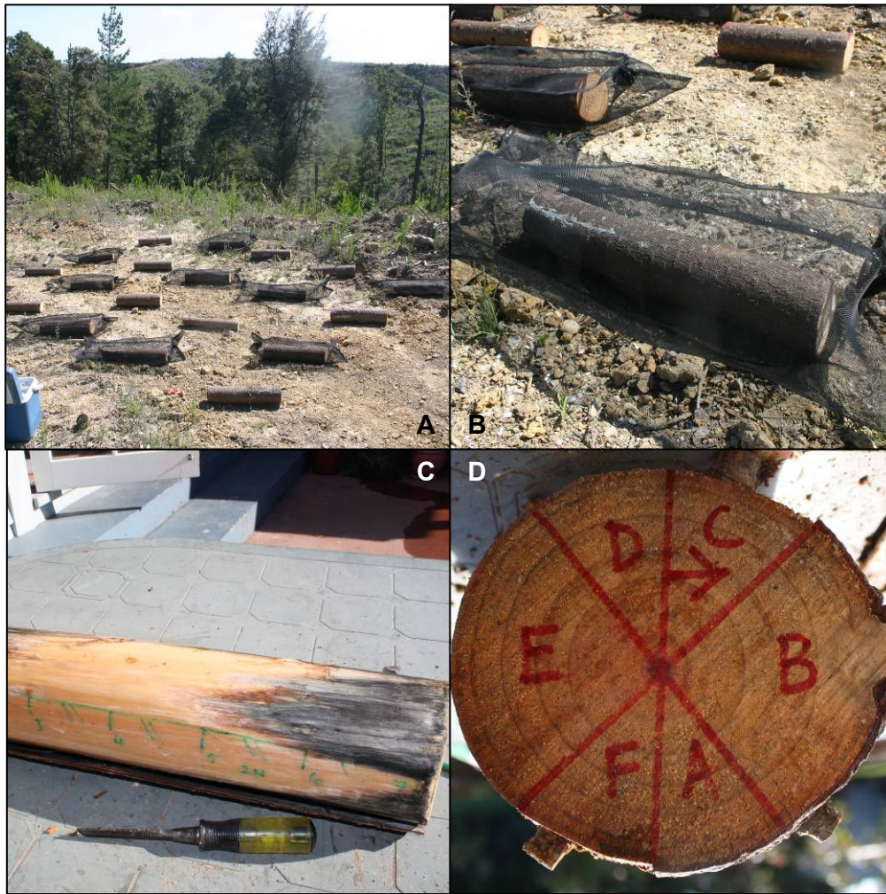
Figure 4. A: Caged and un-caged billet logs set out in a Latin Square design, all logs are facing north. B: A log in its insect exclusion cage with one in the background un-caged. C: Log processing, orientation of the log in the field is recorded and the bark is removed while recording all insects present. D: Stain is measured as a percentage on six segments per cut face (seven cut faces per log).