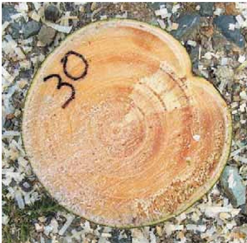
Typical staining and white wood often associated with Neonectria infection.

Sapwood colonised by N. fuckeliana can develop a grey/brown stain. It can also be associated with dry whitened wood. Although N. fuckeliana does not decay the wood, infection can facilitate the entry of decay fungi which can lead to the formation of pockets or columns of decay. This decayed wood is attractive to insects such as huhu ( Prionoplus reticularis ) though these do not colonise beyond the decayed region of the stem.