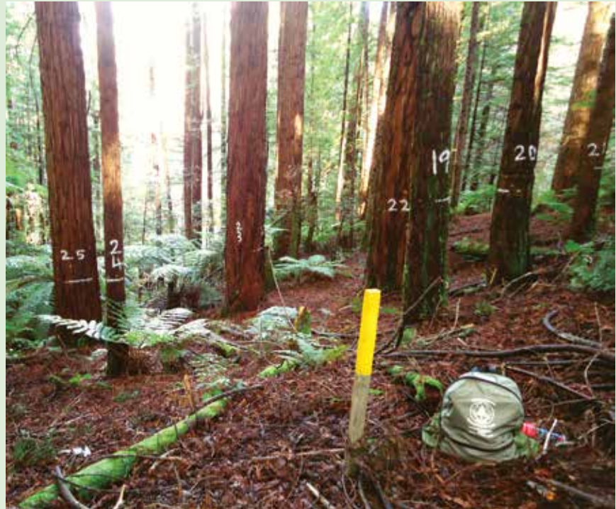
Cuttings from the Kuser trials, now mature redwoods growing in New Zealand forests

The NZ Farm Forestry Association (NZFFA)’s Sequoia Action Group (SAG) was successful in gaining $24,000 for its Redwood Stability Across the Environment project. SAG involves Scion, the NZ Redwood Company and NZ Forestry Ltd.