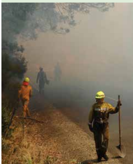
Smoke from the Kaimaumuau fire, Northland, shrouds fire fighters in 2010

As a result, a European Risk Facility has been proposed to support research, contingency planning, community communication, capacity building and post-event response coordination.