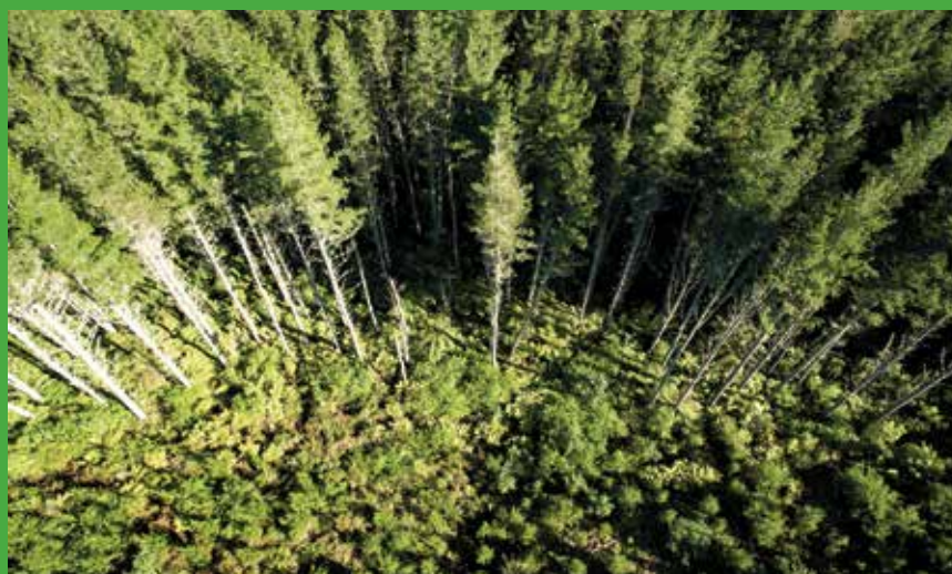
Growing Confidence in Forestry's Future has already told us that final crop stockings are generally too low to maximise site potential